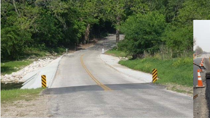
↑ Repair/maintenance of the Lower Seguin Road low water crossing project